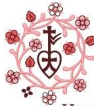
Humanitarian Aid Relief Trust